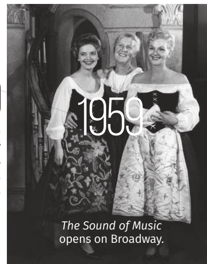
The Sound of Music opens on Broadway.

The Trapp Family Lodge opens in Stowe, Vermont.