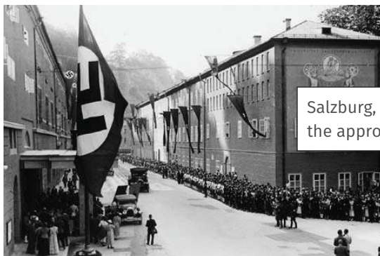
Salzburg, 1938. Nazi flags line the approach to the festival

By the time the festival opened that summer, the von Trapp family had already quietly fled their hometown for freedom, but many more Austrians remained to experience the horrors to come. A symbolic gesture of the Nazi regime found a place of prominence at the festival as 1938 audiences were greeted by banners bearing "the flag with the black spider" lining the thoroughfare. The Anschluss engendered a new reality for all Austrians, including makers and patrons of theatre.