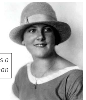
Maria as a young woman

In 1956, Maria learned that Rodgers and Hammerstein were writing a musical based on her life. On November 16 1959, Maria attended the opening night of The Sound of Music on Broadway. Audiences loved the story of Maria and her family, and in 1965 The Sound of Music was adapted into a film starring Julie Andrews. Maria died on March 28 1987 at the Trapp Family Lodge in Vermont.