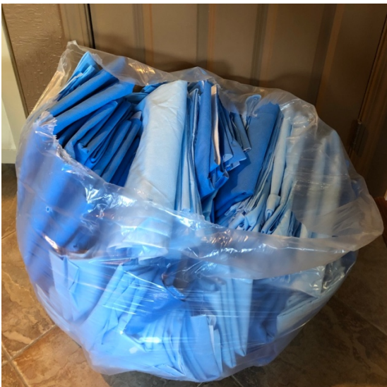
Wraps waiting to be cut!