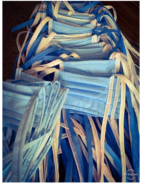
Masks, masks & more masks!